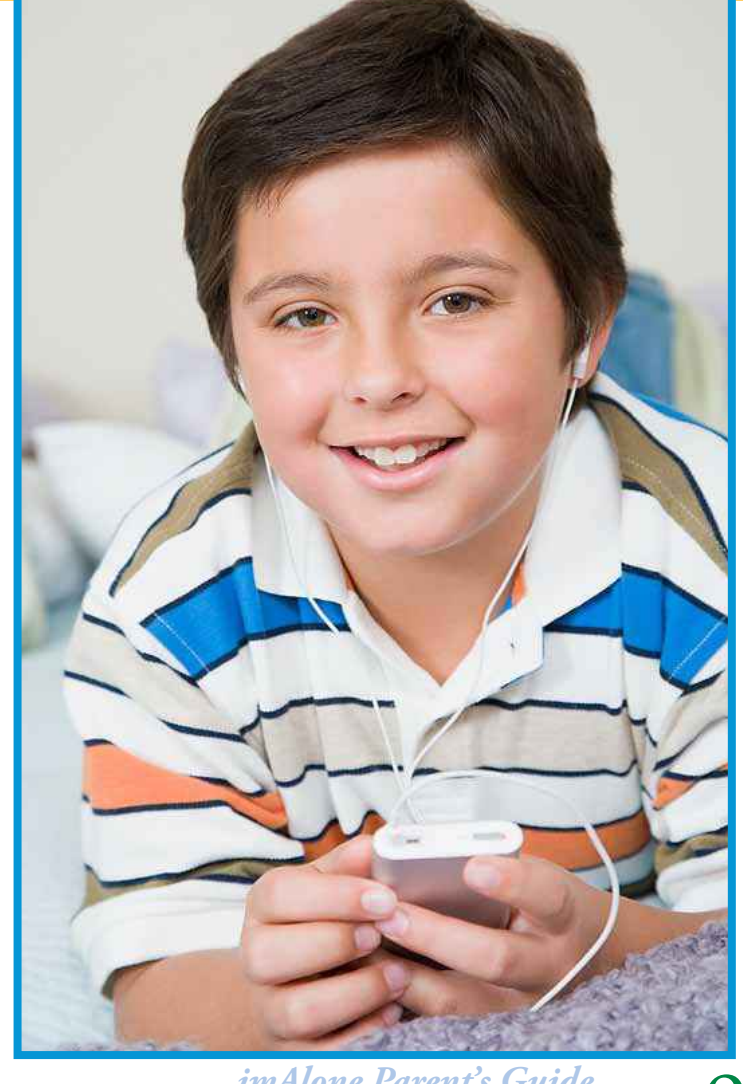
imAlone Parent's Guide