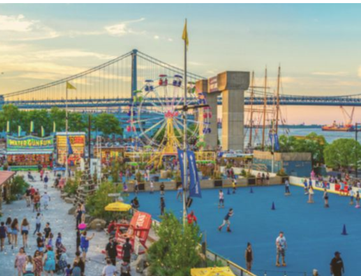
Blue Cross RiverRink Summerfest

Liberty Bell Center Independence Hall The Rocky Statue and the Rocky Steps The LOVE sculpture at John F. Kennedy Plaza Spruce Street Harbor Park Blue Cross RiverRink Summerfest and Winterfest Once Upon a Nation Storytelling Benches Schuylkill Banks and Schuylkill Banks Boardwalk The President's House: Freedom and Slavery in the Making of a New Nation Independence Visitor Center Franklin Square Carpenters' Hall Institute of Contemporary Art Bartram's Garden Rail Park Science History Institute The Fabric Workshop and Museum Smith Memorial Playground Fireman's Hall Museum Ryerss Museum & Library